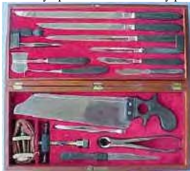
Medical Instruments Used in Late 1700s

In the late 1700s, the most popular therapy for most ailments was bloodletting. Some doctors had so much faith in bleeding that they were willing to remove up to four-fifths of the patient's blood. Other therapies of choice included blistering--placing caustic or hot substances on the skin to draw out infections--and administering dangerous chemicals to induce vomiting or purge the bowels. Massive doses of a mercury-containing drug called calomel cleansed the bowels, but at the same time caused teeth to loosen, hair to fall out, and other symptoms of acute mercury poisoning.