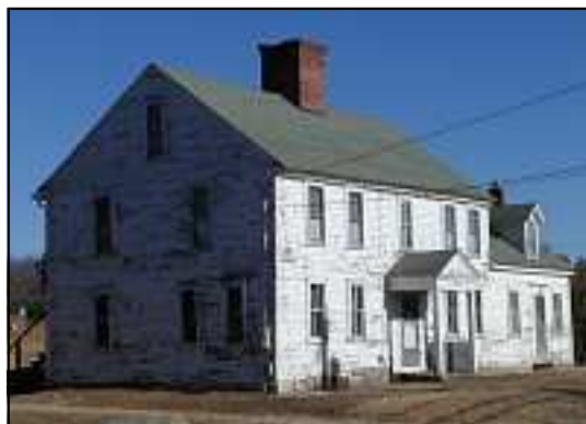
THEN - DR. REUBEN MASON HOUSE