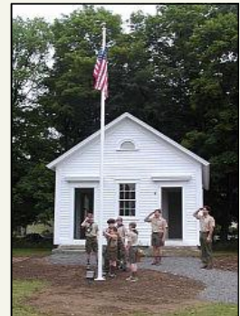
Evans School House Dedication June 14, 2003

Donations can be specifically designated to the Endowment Fund on your check donation. For further information, call 568-5306.